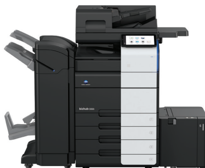
bizhub i-Series C650i