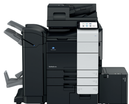
bizhub i-Series 950i